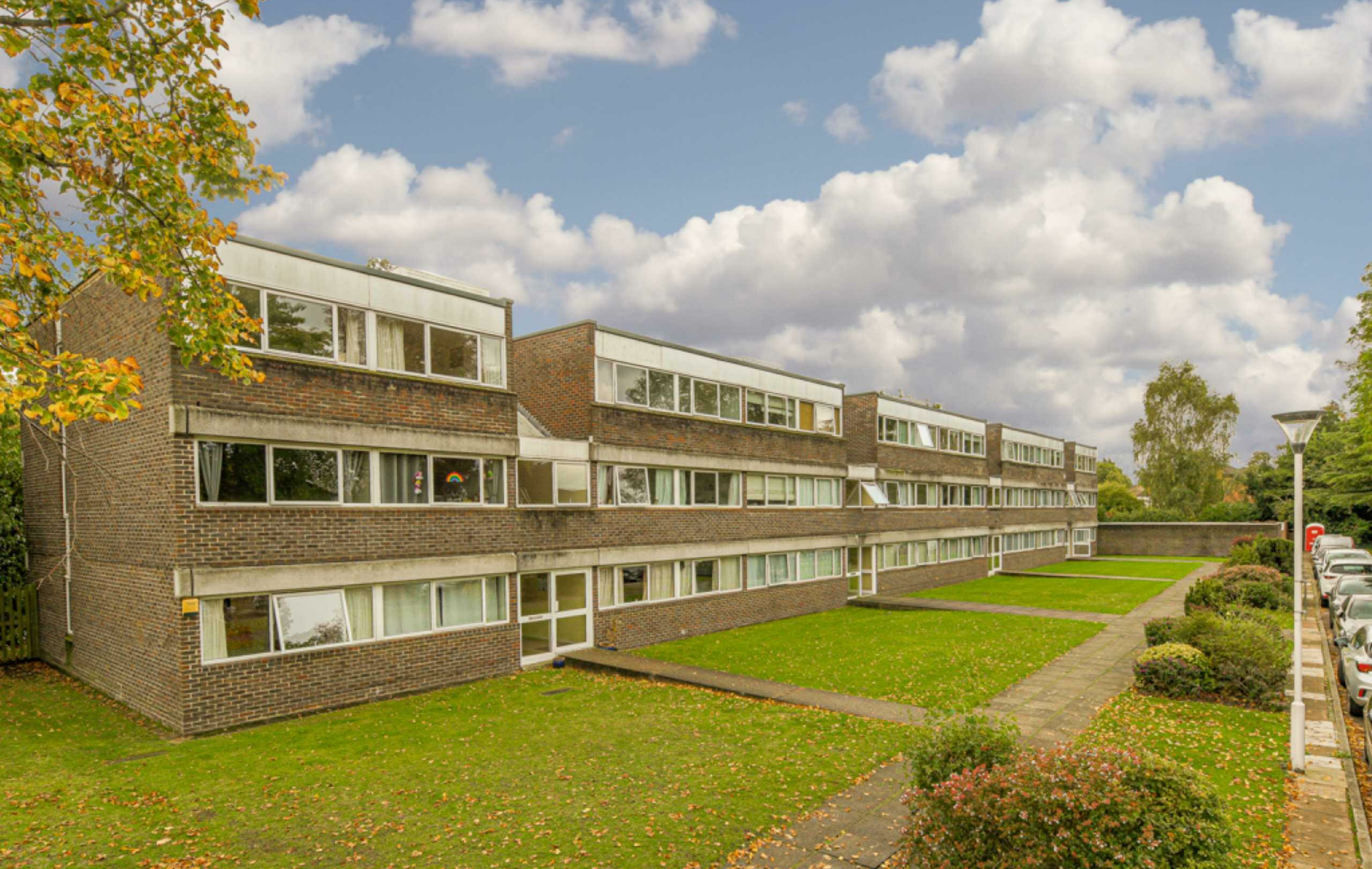
Chichester Court, Ewell Village